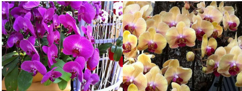
ORCHIDS ON DISPLAY SAIGON BOTANICAL GARDENS, TET, 2012

MAY 5-6.....SOUTH CENTRAL WASHINGTON ORCHID SOCIETY SHOW AND SALE, KENNEWICK