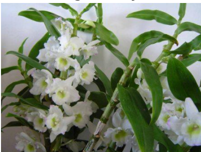
Dendrobium Spring Dream 'Appllon'