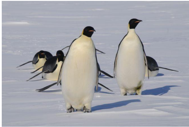
I sent these guys to look for orchids but they failed to find any. Do you know why?