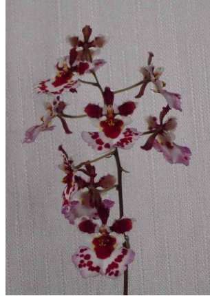
Tolumnia popki 'Mitzi' (Tom)