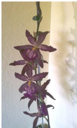
Bllra. Marfitch "Howard's Dream" AM/AOS