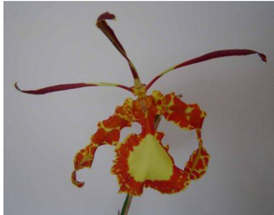
Psychopsis

AN EXPERIMENT WITH LIGHT: People often ask me “Why doesn’t my orchid bloom?”. When I inquire where the orchid is growing, the reply is “a sunny window. It has a lot of light.” Do you really know how much light your orchid receives. Is it enough? I decided to test that question. I have a light meter and at 12 noon on a recent sunny fall day, I took my light meter to different locations and tested the intensity. Here are the results. You may be surprised as to how little usable light your orchid may be receiving.