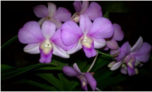
Dendrobium unknown name