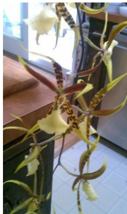
Brassia unknown name