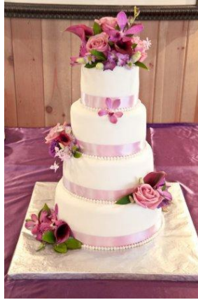
Wedding cake decorated with orchids and roses